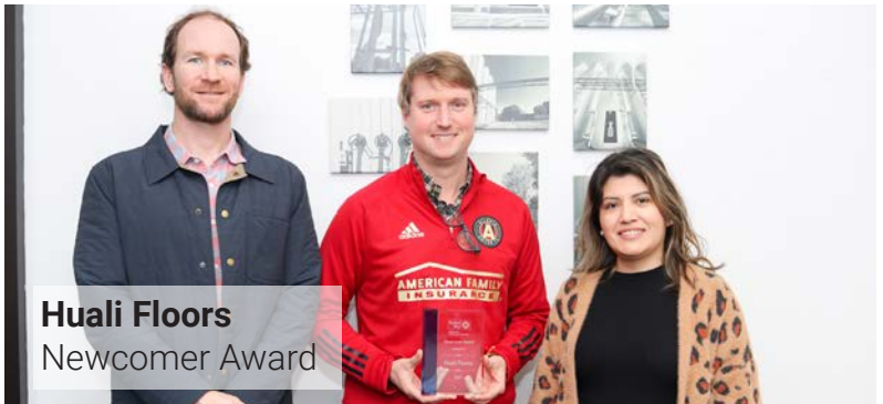
Huali Floors Newcomer Award