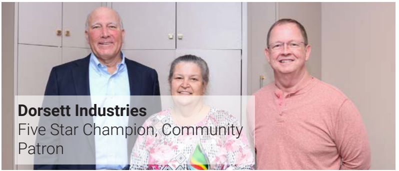
Dorsett Industries Five Star Champion, Community Patron