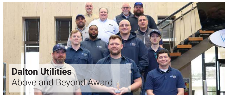
Dalton Utilities Above and Beyond Award