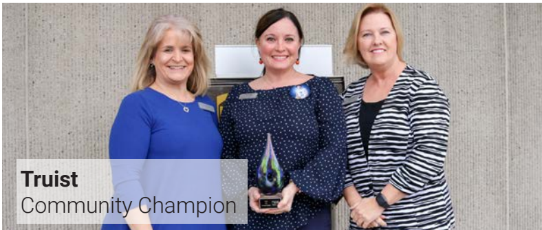
Truist Community Champion