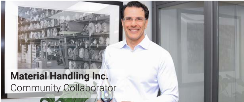
Material Handling Inc. Community Collaborator