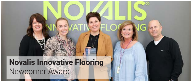
Novalis Innovative Flooring Newcomer Award