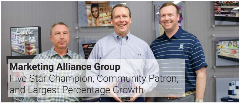
Marketing Alliance Group Five Star Champion, Community Patron, and Largest Percentage Growth