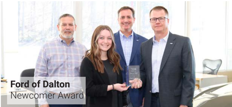
Ford of Dalton Newcomer Award