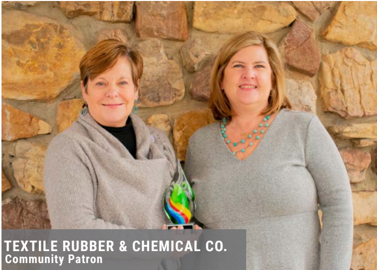
TEXTILE RUBBER & CHEMICAL CO. Community Patron