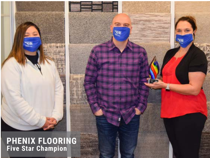
PHENIX FLOORING Five Star Champion