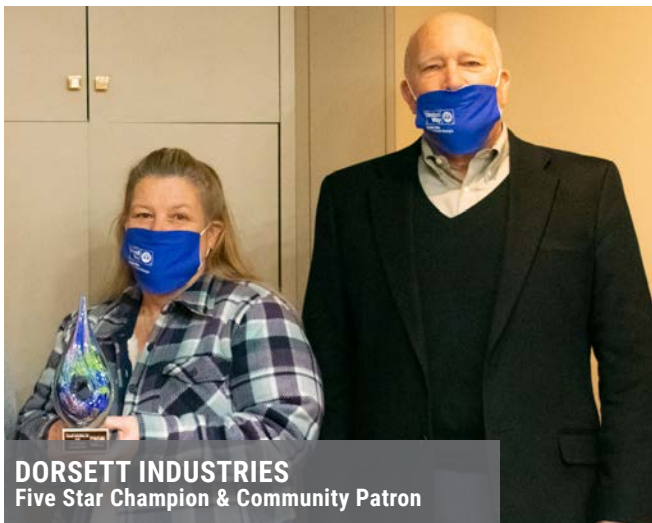
DORSETT INDUSTRIES Five Star Champion & Community Patron