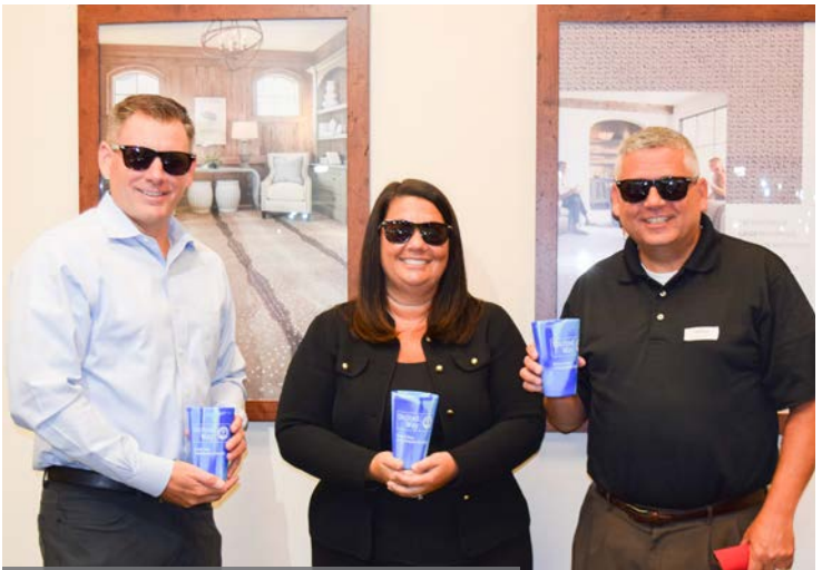
MOHAWK INDUSTRIES Five Star Champion & Community Builder