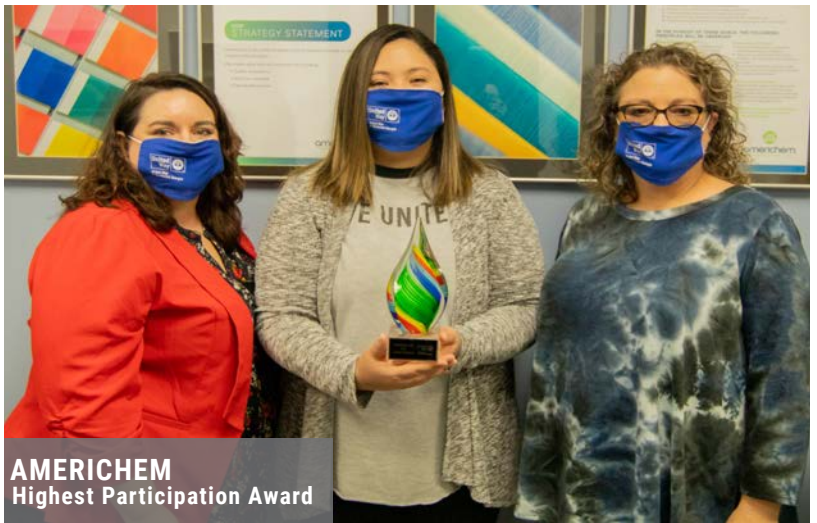
AMERICHEM Highest Participation Award