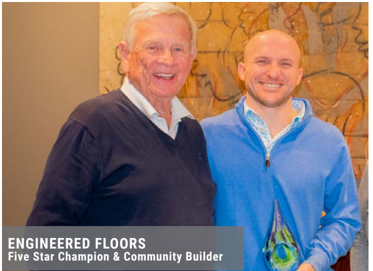
ENGINEERED FLOORS Five Star Champion & Community Builder