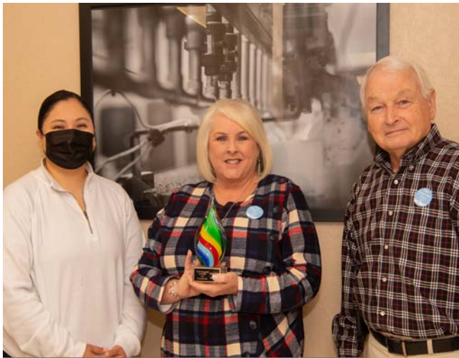
TEXTILE MANAGEMENT ASSOCIATES Community Patron