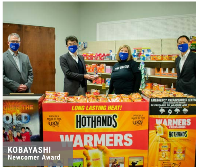
KOBAYASHI Newcomer Award