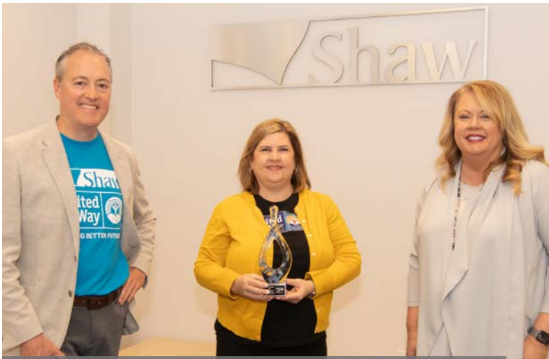
SHAW INDUSTRIES Five Star Champion, Community Pillar, and Campaign Innovation