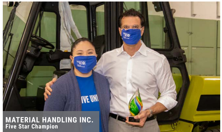
MATERIAL HANDLING INC. Five Star Champion