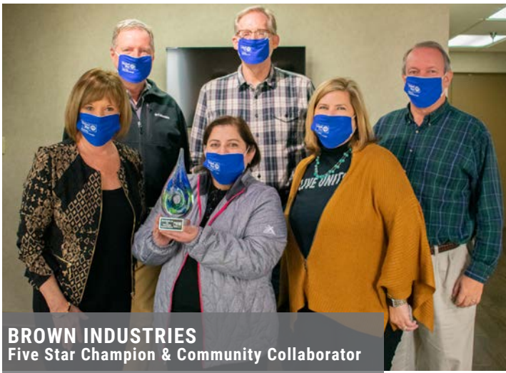
BROWN INDUSTRIES Five Star Champion & Community Collaborator