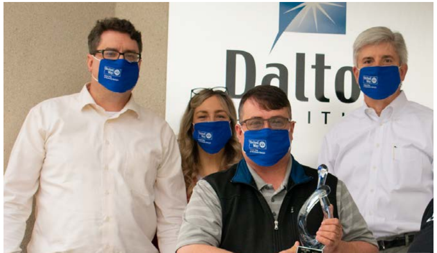
DALTON UTILITIES Five Star Champion, Community Collaborator, & Largest Percentage Growth