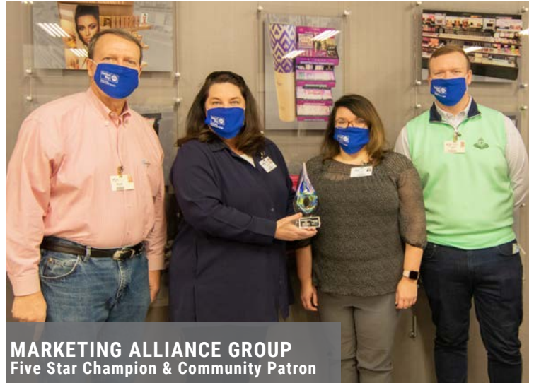
MARKETING ALLIANCE GROUP Five Star Champion & Community Patron