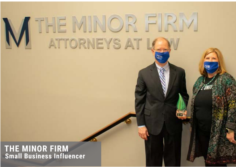
THE MINOR FIRM Small Business Influencer