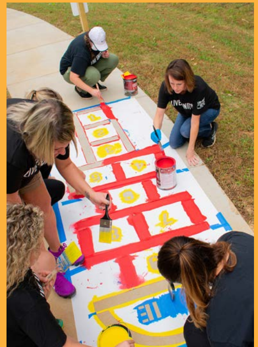
Phenix Flooring employees painting the path for the Born Learning Trail at Chatsworth-Murray Library.

Make A Difference Day, sponsored by Brown Industries and Phenix Flooring, mobilized 300 volunteers who gave 856 hours of service.