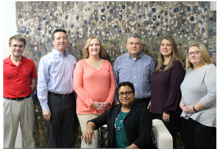
MOHAWK INDUSTRIES Five Star Champion & Community Builder