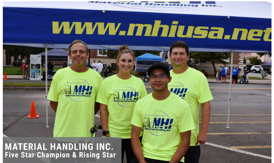
MATERIAL HANDLING INC. Five Star Champion & Rising Star