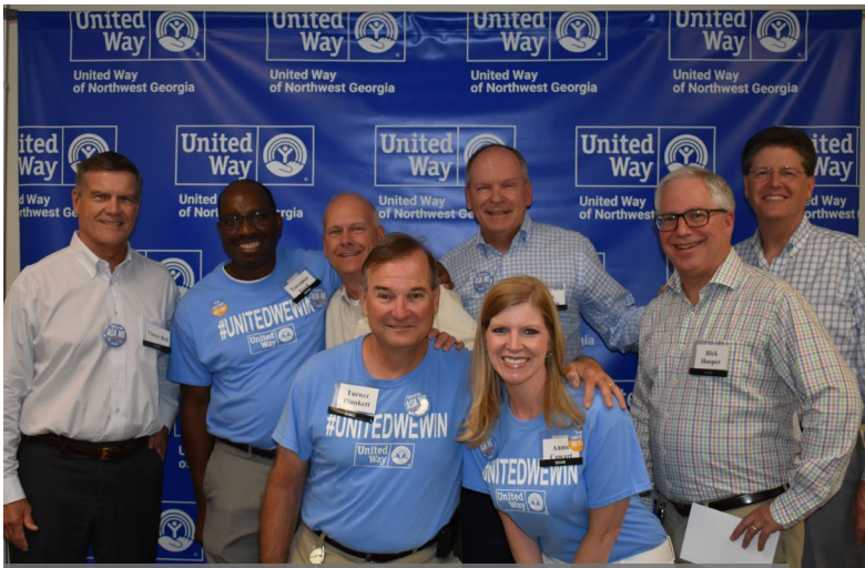
SHAW INDUSTRIES Five Star Champion & Community Pillar