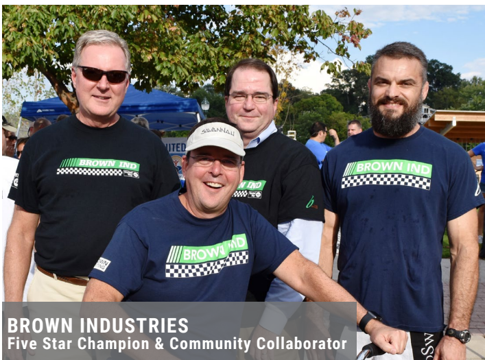
BROWN INDUSTRIES Five Star Champion & Community Collaborator