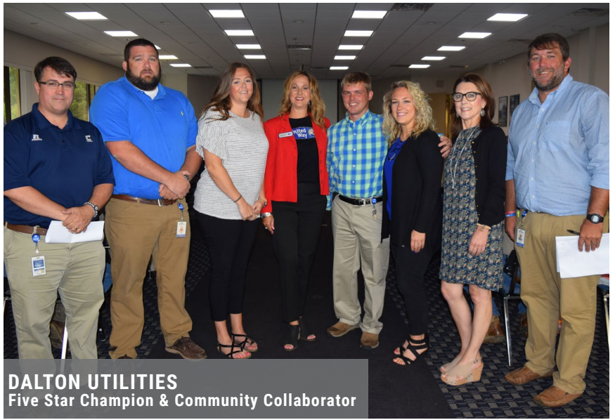
DALTON UTILITIES Five Star Champion & Community Collaborator