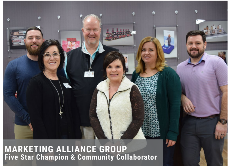
MARKETING ALLIANCE GROUP Five Star Champion & Community Collaborator