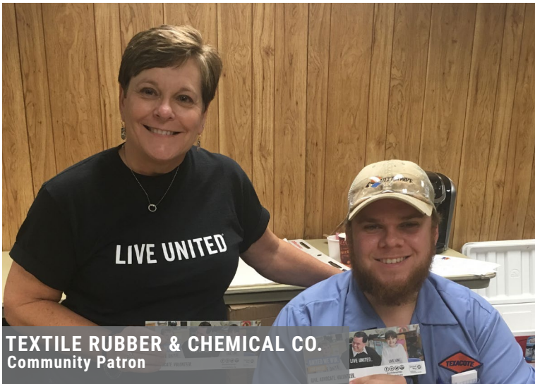
TEXTILE RUBBER & CHEMICAL CO. Community Patron