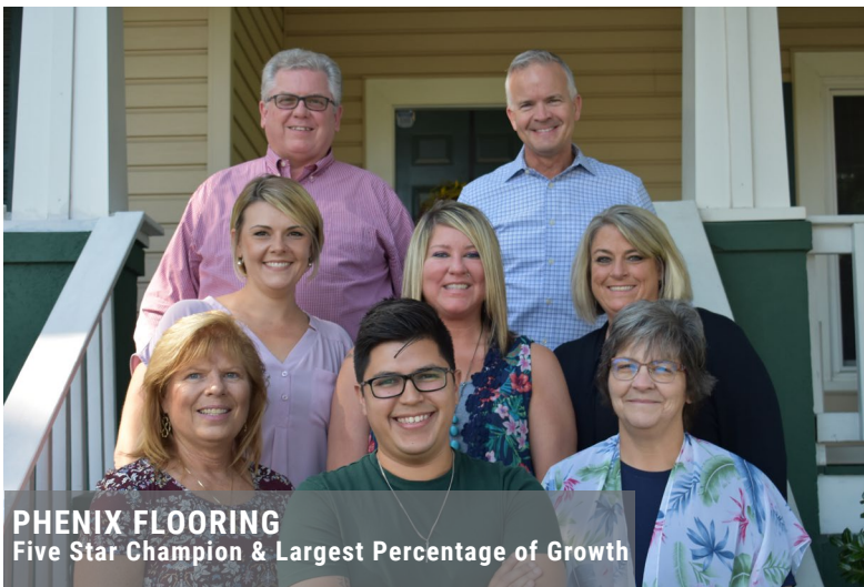
PHENIX FLOORING Five Star Champion & Largest Percentage of Growth