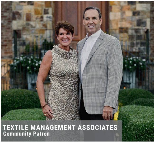
TEXTILE MANAGEMENT ASSOCIATES Community Patron