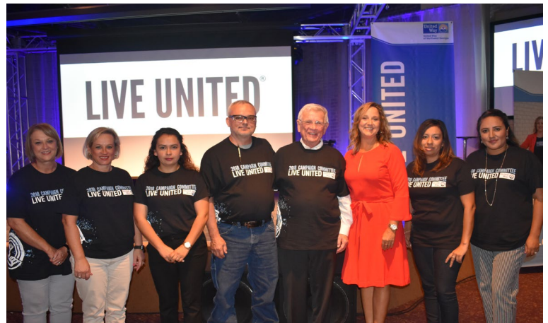
ENGINEERED FLOORS Five Star Champion, Community Builder, & Largest Dollar Increase