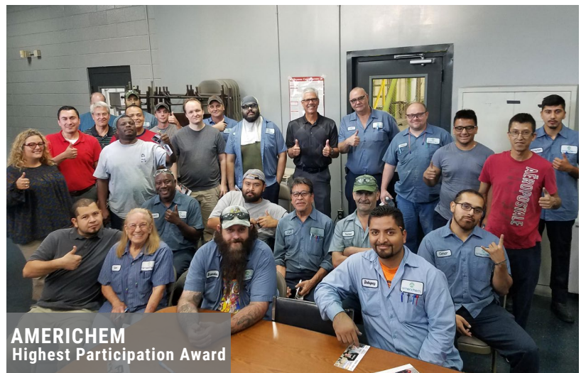
AMERICHEM Highest Participation Award