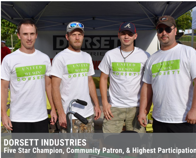
DORSETT INDUSTRIES Five Star Champion, Community Patron, & Highest Participation