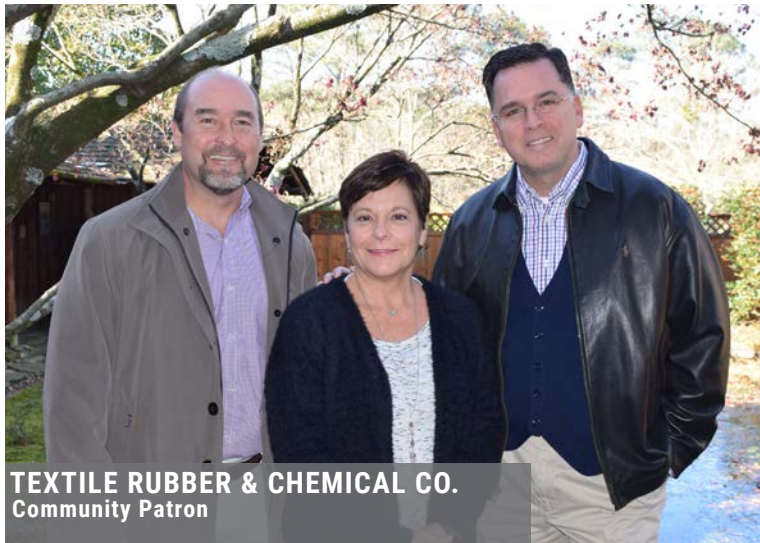
TEXTILE RUBBER & CHEMICAL CO. Community Patron