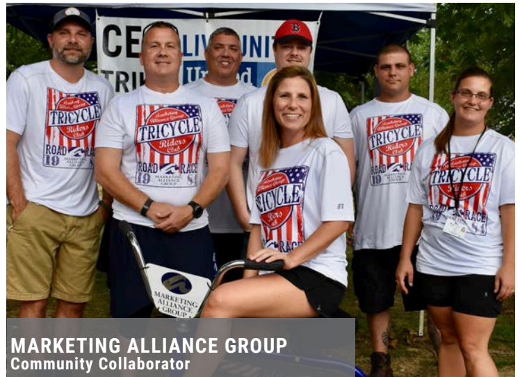
MARKETING ALLIANCE GROUP Community Collaborator