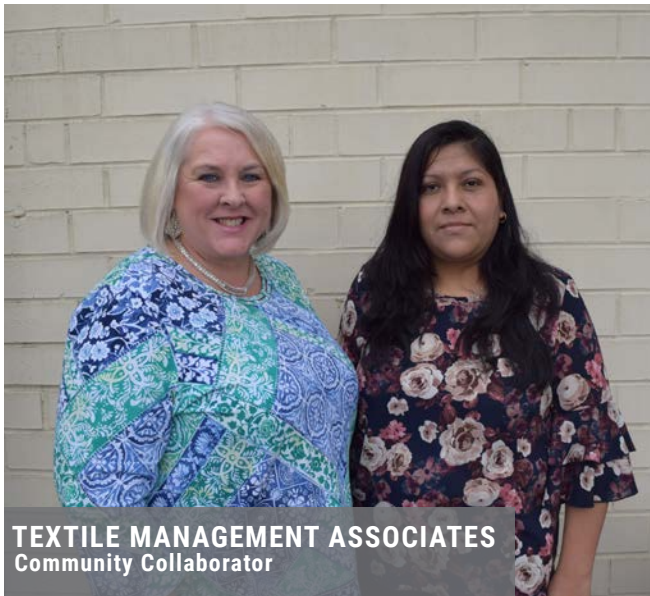
TEXTILE MANAGEMENT ASSOCIATES Community Collaborator