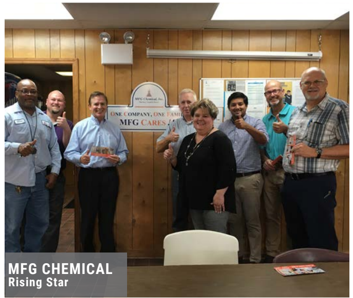
MFG CHEMICAL Rising Star