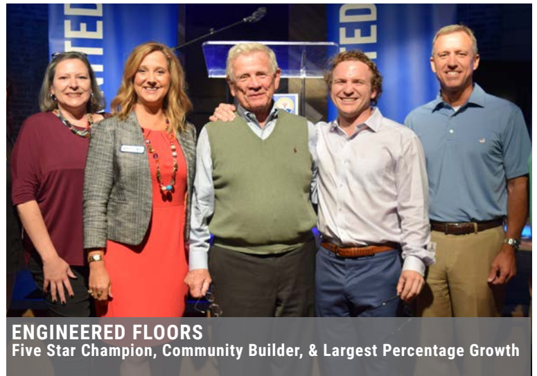
ENGINEERED FLOORS Five Star Champion, Community Builder, & Largest Percentage Growth