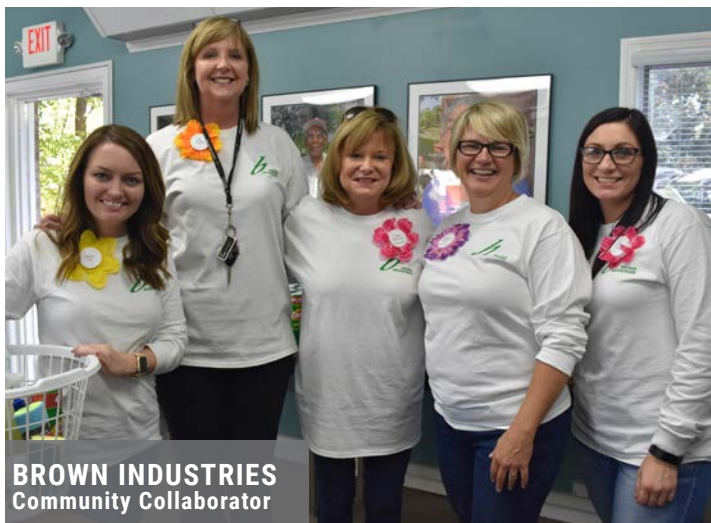
BROWN INDUSTRIES Community Collaborator