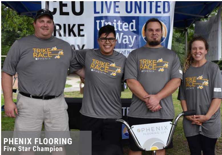
PHENIX FLOORING Five Star Champion