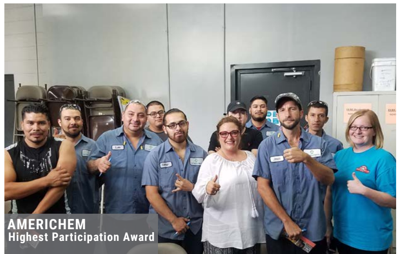
AMERICHEM Highest Participation Award