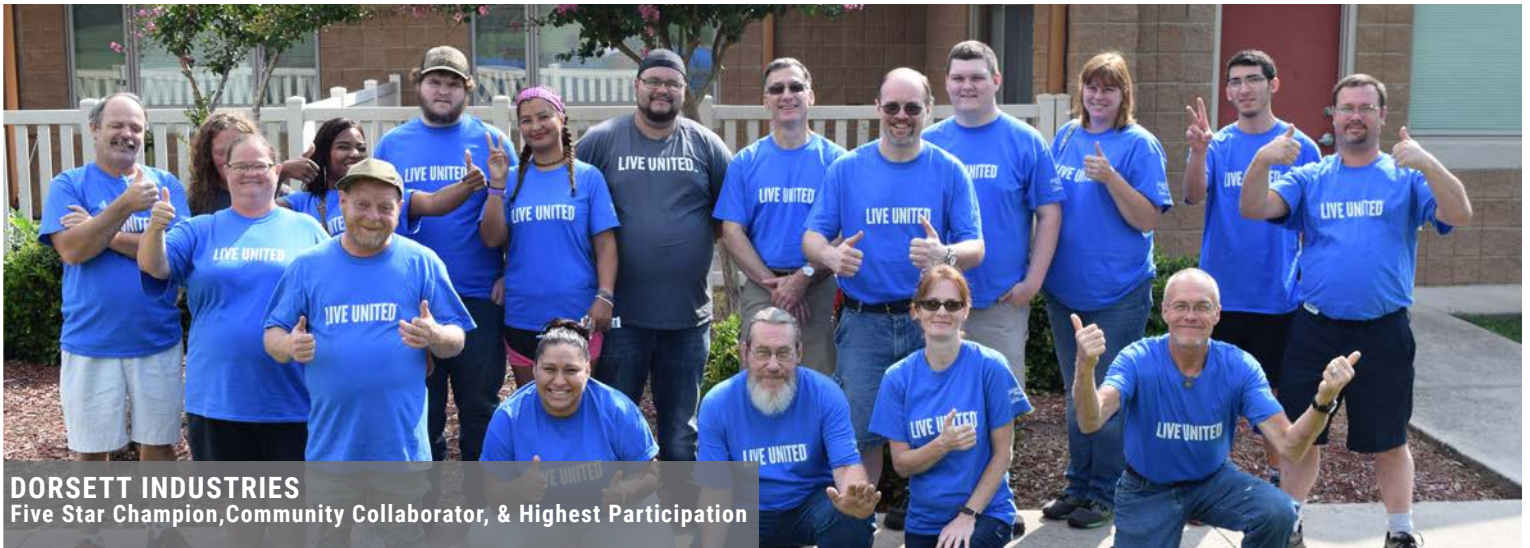
DORSETT INDUSTRIES Five Star Champion, Community Collaborator, & Highest Participation