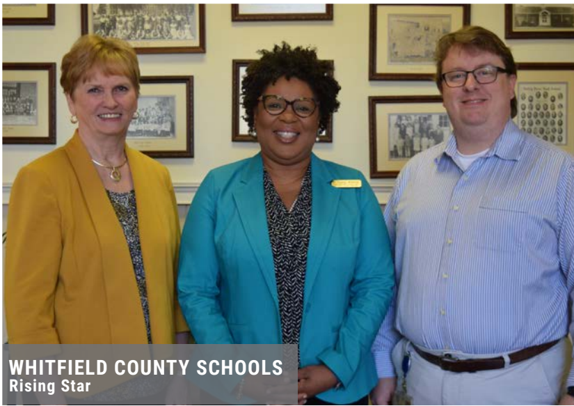
WHITFIELD COUNTY SCHOOLS Rising Star