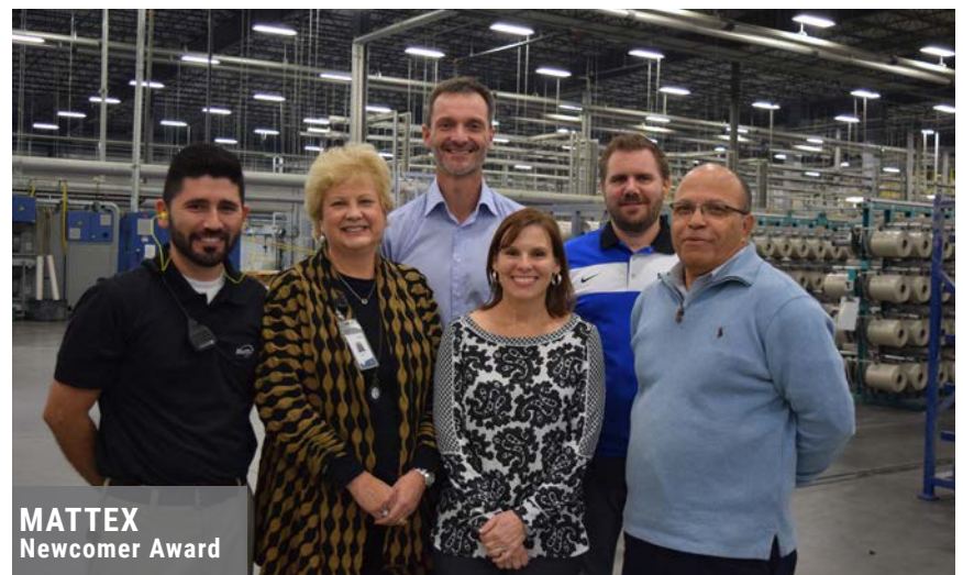
MATTEX Newcomer Award