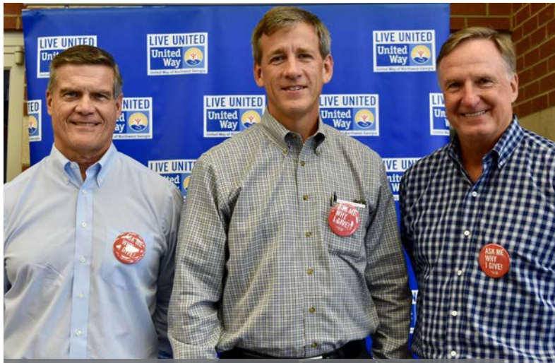
SHAW INDUSTRIES Five Star Champion, Community Pillar, & Largest Dollar Increase