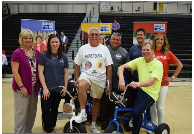
MOHAWK INDUSTRIES Five Star Champion & Community Builder