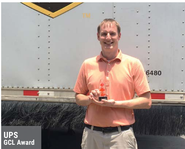
UPS GCL Award