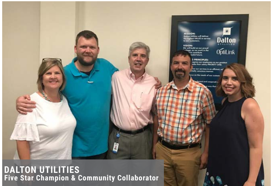
DALTON UTILITIES Five Star Champion & Community Collaborator